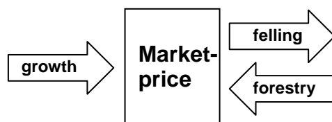
Figure 3. It is possible to optimize the economy only if the market value can be dynamically calculated

Production value is only generated by growth and revenue from felling. Both production value and revenue can be effected by different management activities. It should be stressed that felling transfers financial values from the “forest bank” to the financial values.