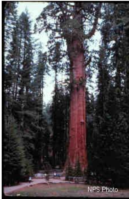
Figure 2. General Sherman.